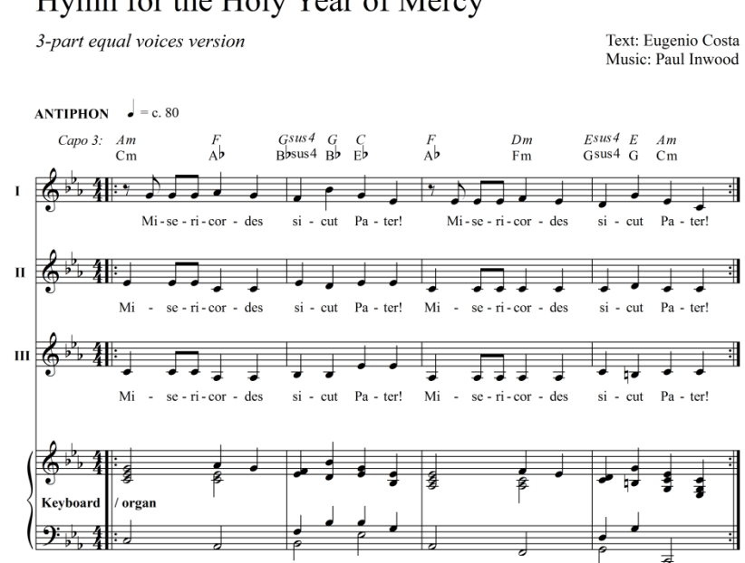
Copyright © 2015, Pontifical Council for the Promotion of the New Evangelization. All rights reserved.