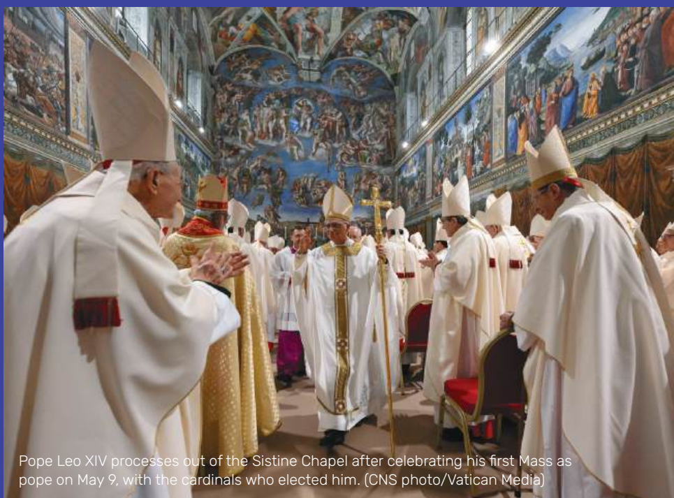
Pope Leo XIV processes out of the Sistine Chapel after celebrating his first Mass as pope on May 9, with the cardinals who elected him.